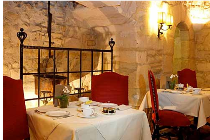
Enjoy breakfast in the unique setting of our 13th century vaulted room.