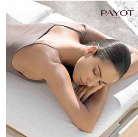
Select a massage or a treatment and let us take care of you.