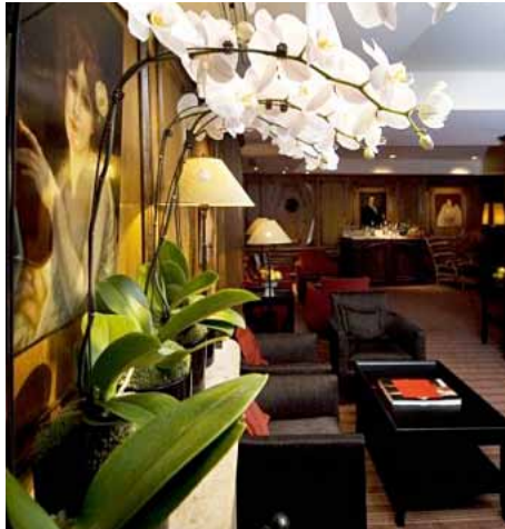
Our lounge with its Honesty-Bar.