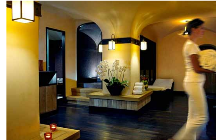
For an extensive work-out or to unwind in the jacuzzi or in the sauna...